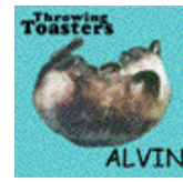
Alvin, CD 1999